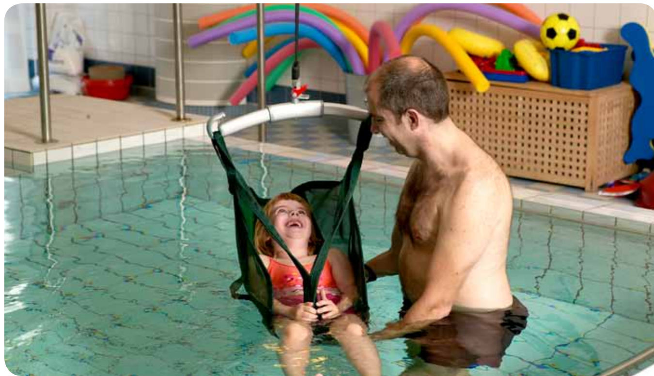
Liko offers several different sling models that are ideal for bath and shower situations. Pictured here, Original High Back Sling, Mod. 20 in a polyester fabric that lets water run through.