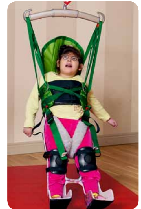
TeddyVest for Standing Shell, Mod. 67

Application area: We have designed the Vest for Standing Shell for the often difficult lifting situation where a child in a standing shell has to be raised from the floor to a standing position. The lift takes all the weight and the child is lifted safely and comfortably with support for the entire body and head.