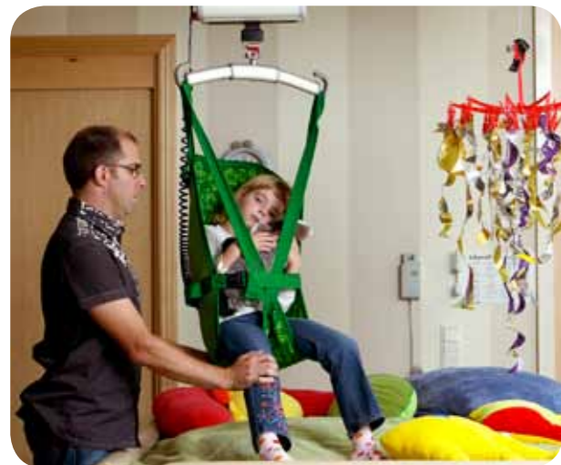
Teddy Sling Soft Original, Mod. 26 is one of our most common models. Secure, safe and comfortable.