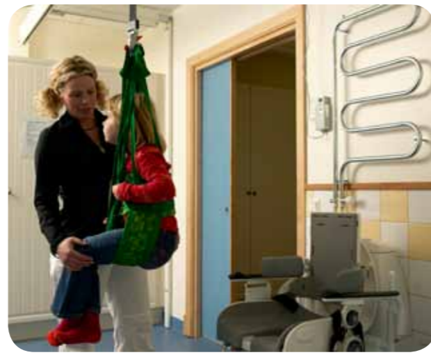
We have several alternatives that facilitate visits to the toilet. Shown here is Teddy HygieneVest, Mod. 50, which enables undressing when the patient is sitting in the sling.