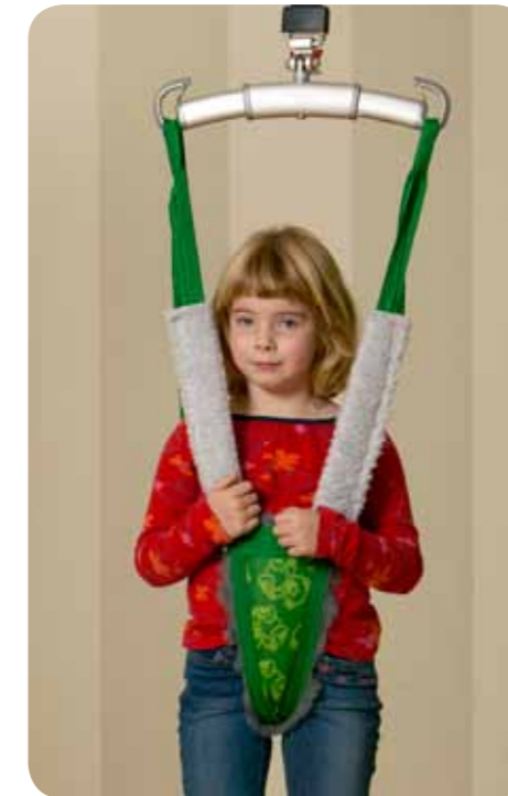
Teddy Pants, Mod. 92

Application area: Lift Pants in Teddy fabric make gait training not only safe, but fun. Kids love to hop around in Teddy Pants.