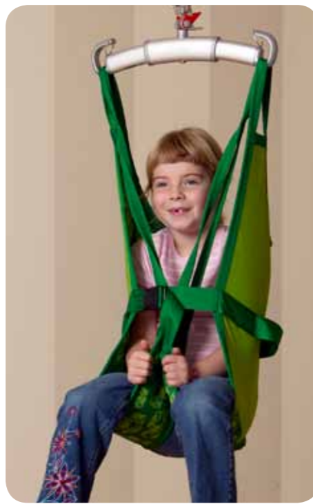
Teddy Sling Original, Mod. 10

Application area: Teddy Sling Original is ideal for lifting to and from sitting/semi-sitting positions or floor, if the child requires no extra support for the head.