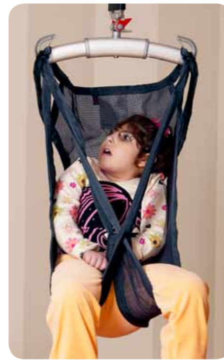
Silhouette Sling, Mod. 22

Sizes: XS (Prod. No. 3526813) S (Prod. No. 3526814)