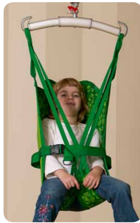
Teddy Sling Soft Original, Mod. 26

Sizes: XS (Prod. No. 3510863) S (Prod. No. 3510864)